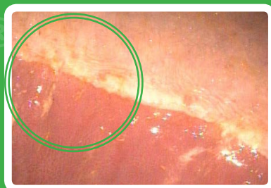
After 3 weeks of Egusin® supplementation

Provided a healthy environment for lesion healing which promoted resolution of the ulcer issue