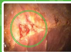
Lesions before using Egusin®